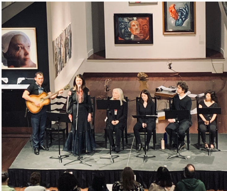
Worldwide Readings Project for Ukraine - 4.30.22