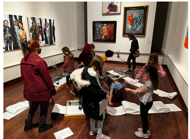
A field trip engages with one of the exhibits.