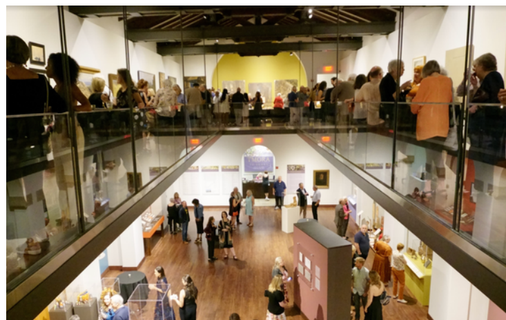
TMORA 20 Years: Anniversary Exhibition Opening Reception - 8.27.22