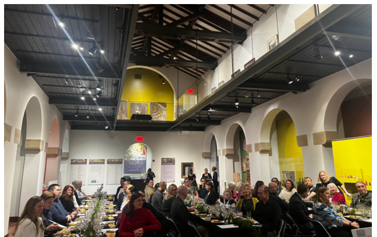
Champagne & Caviar Tasting presented in partnership with France 44 Wine and Spirits - 12.20.22