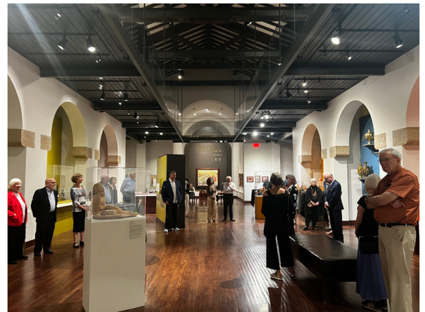
RACS Exclusive Preview - Tour with the Curator