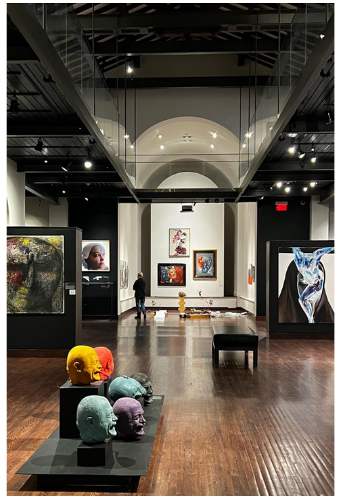
ID ART/TECH: Selections from the Kolodzei Foundation and the Frants Family Collection