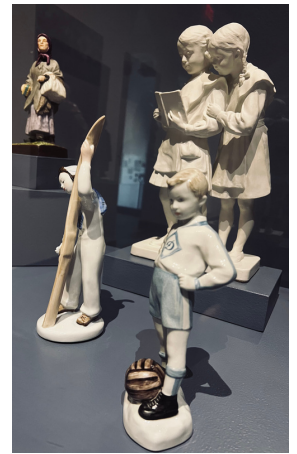
Soviet Porcelain TMORA: 20 Years