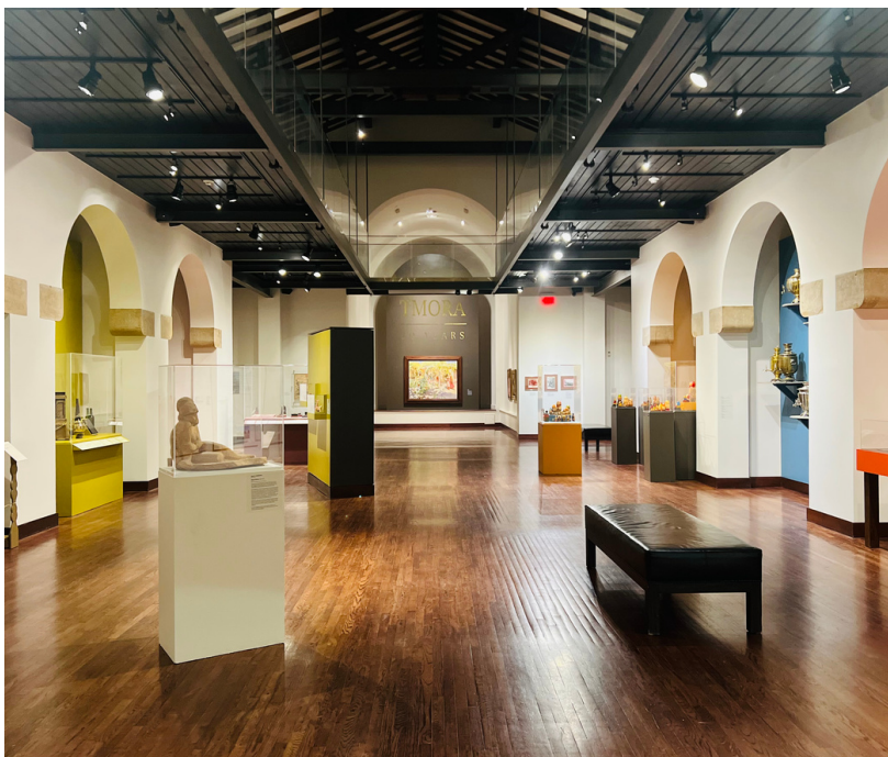
TMORA: 20 Years