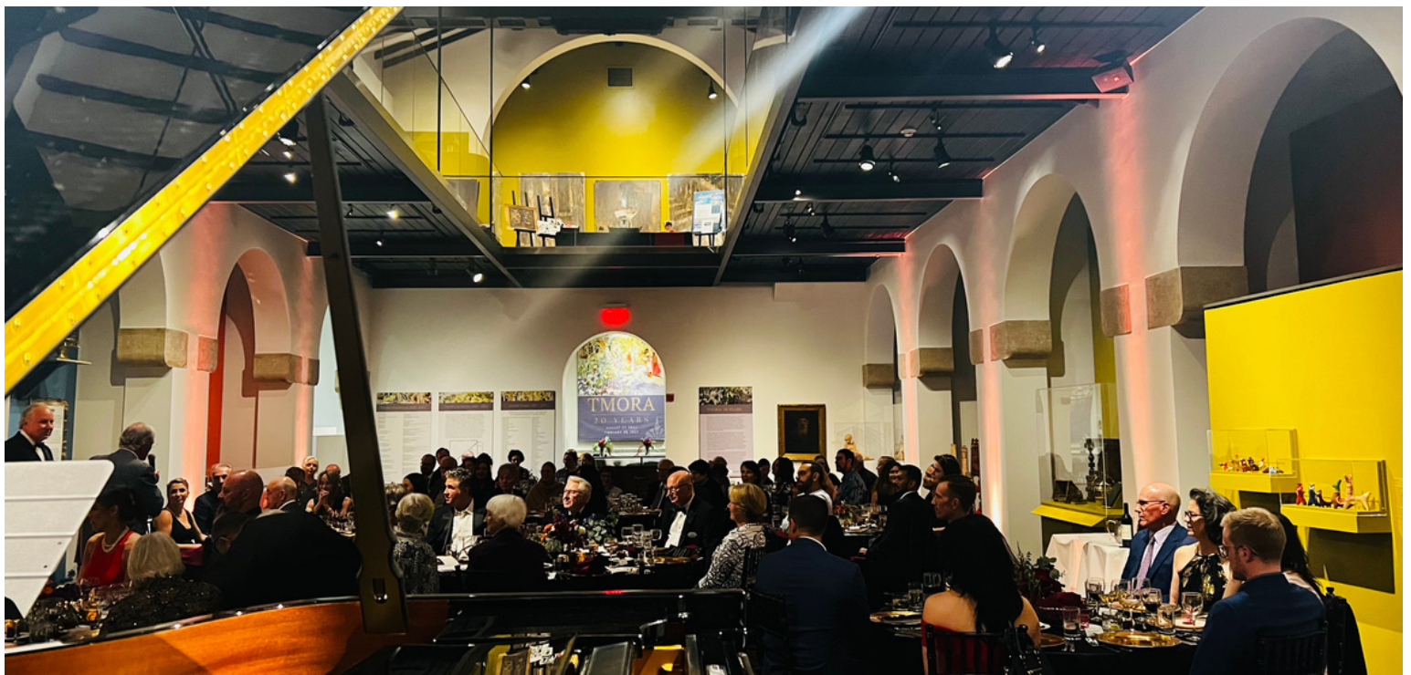
TMORA's 20th Anniversary Legacy Dinner