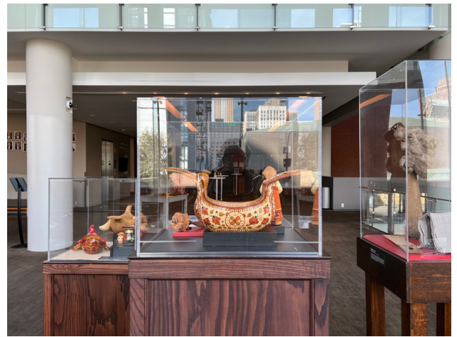
TMORA exhibition at Orchestra Hall - a partnership with Minnesota Orchestra