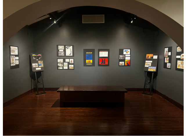
Say No to War: Political Cartoons by Ukrainian and Russian Artists