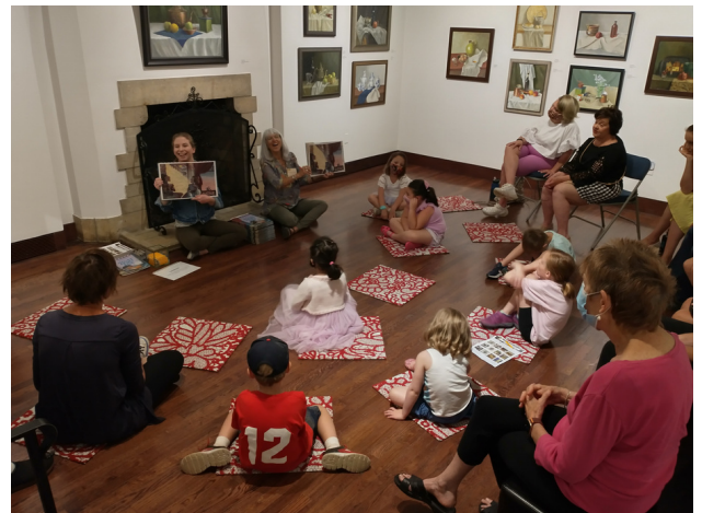
Story Time in the Gallery

Information about how to support TMORA through your donor-advised fund, with gifts of stock, an IRA distribution, or legacy gift planning can be found at www.tmora.org/giving or by contacting the Museum directly at 612-821-9045. You may also make a gift, renew your membership, and buy tickets for upcoming events.