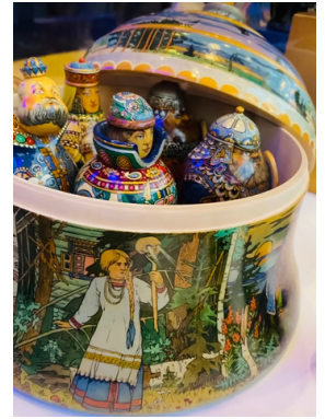
Holiday Exhibition at Orchestra Hall Partnership with Minnesota Orchestra