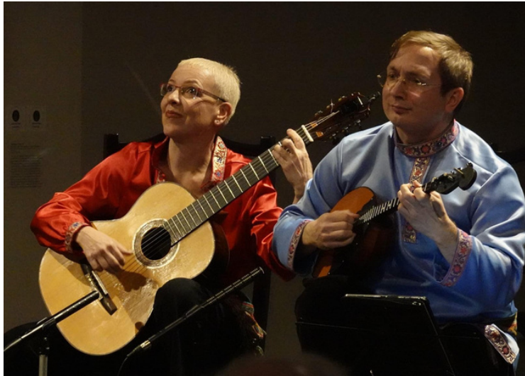
Musalliance: Musical Journey Around the World - 2.12.22