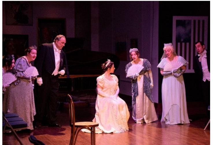
Skylark Opera Theater & TMORA present Eugene Onegin - 3.25 - 4.3.22