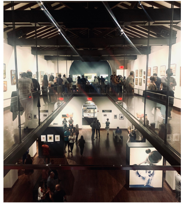
Russian Art After Dark - 8.06.21