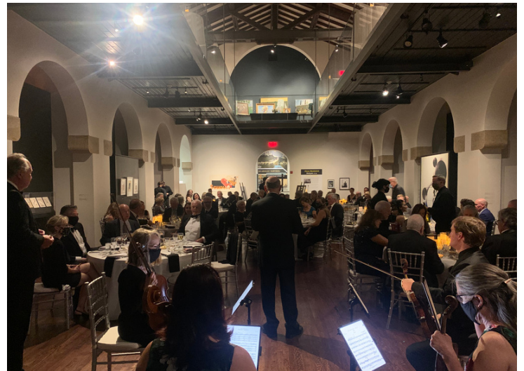
White Nights Annual Fundraising Dinner - 9.11.21