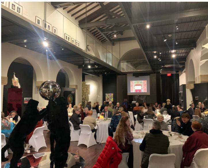
Afternoon Tea at TMORA - 11.13.21