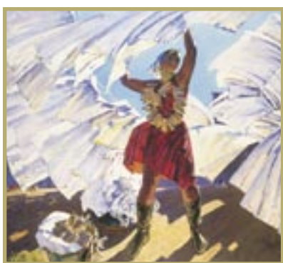
A Sunny Day by Mai Dantsig

" Perspectives provides a broad survey of 20th-century Russian art that allows visitors to see that Soviet art was not limited to highly politicized portrait or poster art. From the idealism of the Itinerants to the cynicism of the Severe Style artists, the exhibit captures the many emotions of the individual artists and