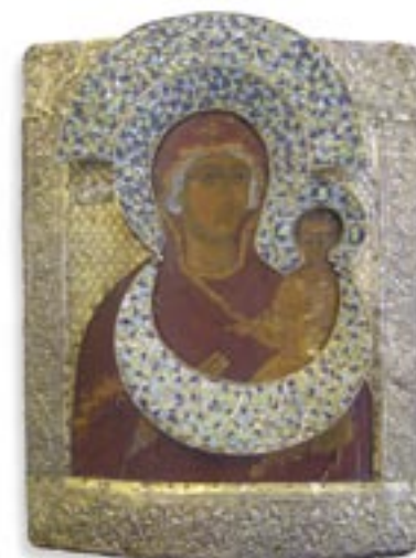
Our Lady Hodigitria