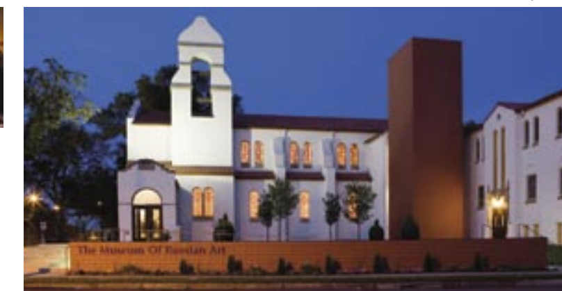
TMORA is located at I-35W and Diamond Lake Road in Minneapolis