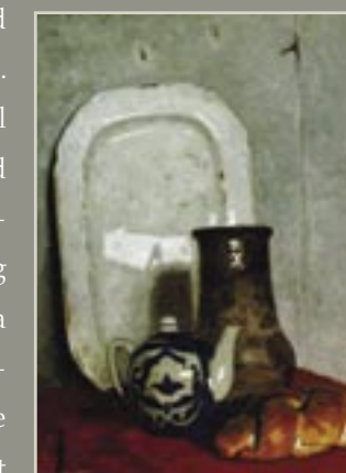
GELI KORZHEV TEAPOT AND OLD RUSSIAN VESSEL 25½ x 31½ inches 1977 Oil on canvas