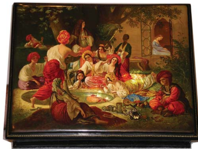
"Scheherezade," 1994, was painted by Fedoskino artist Yevgeny Starykh. 10 1/4 x 8 x 2 3/4 inches. From the David Christensen Collection.

Styles, techniques, colors and materials used in painting lacquer boxes vary greatly within the four-village cooperative. The artists of Palekh, Fedoskino, Kholui and Mstera have all contributed to the development of their villages' respective and distinctive artistic styles. For example, while the artists of Palekh, Kholui and Mstera use egg tempera, Fedoskino artists apply layer upon layer of thinly diluted oil tempera. Fedoskino artists' style is more realistic because, unlike the other three schools, its roots are not in iconography. Kholui artists, too, paint figures in