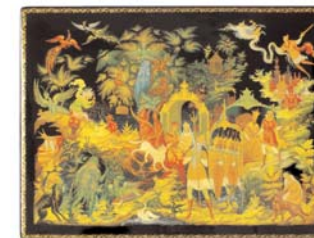
"The Curved Seashore" lacquer box. 9 3/8 x 7 x 2 inches