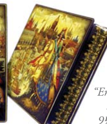
"Emperor Peter I" lacquer box. 9 1/2 x 7 1/2 x 1 3/4 inches