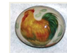
"The Cock" egg-shaped chest. 2 3/8 x 2 x 1 1/2 inches